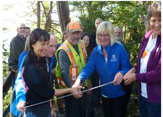
Work Bee & Grand Opening of Inspiration Point.